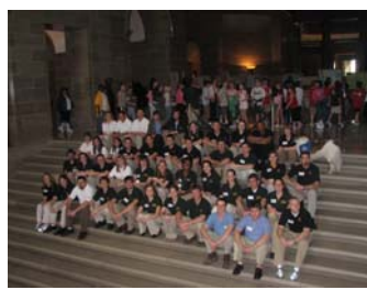
Students gather at the capitol for the UM undergraduate Research Day event.