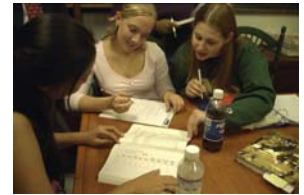
Students who receive an alert should be encouraged to take action by visiting with their instructor or academic advisor.

For more information, please visit the on-line tutorial at: http://campus.UMR.edu/acalert/ , or contact UGS at 341-7276.