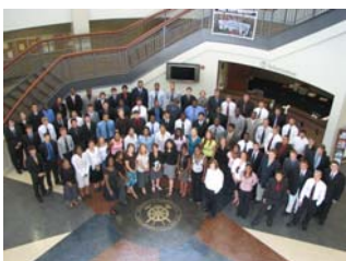
Eighty-nine new students participated in HGR, a four week summer program designed to enhance student academic skills.

Hit the Ground Running (HGR) is a four week summer program focused on assisting students with adjusting to college life, adopting academic excellence strategies, developing leadership skills, and adopting strategies that encourage student responsibility and ownership of realistic academic expectations.