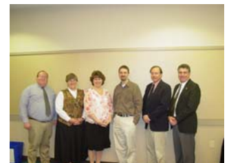
Recipients of the 2005-06 Outstanding Academic Advising Award at the awards luncheon on April 26.